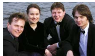
Atrium String Quartet