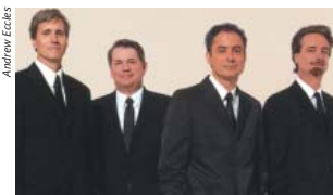
Emerson String Quartet