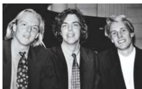
Storioni Trio Amsterdam