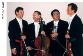
Endellion String Quartet

In association with the Workers Educational Association (London District)