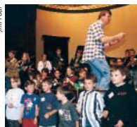
Family Jazz Day