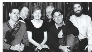
Vienna String Sextet