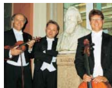
Vienna Brahms Trio